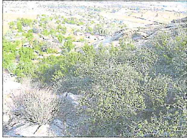
A Palmer's oak in Jurupa Valley in Riverside County that is believed to be about 13,000 years old is pictured in a December 2009 photo.